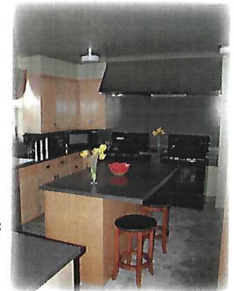
Facility Kitchen Area

You may call for reservations or information to 515-885-0389 or to Randy Rowlet at cell: 515-306-9231.